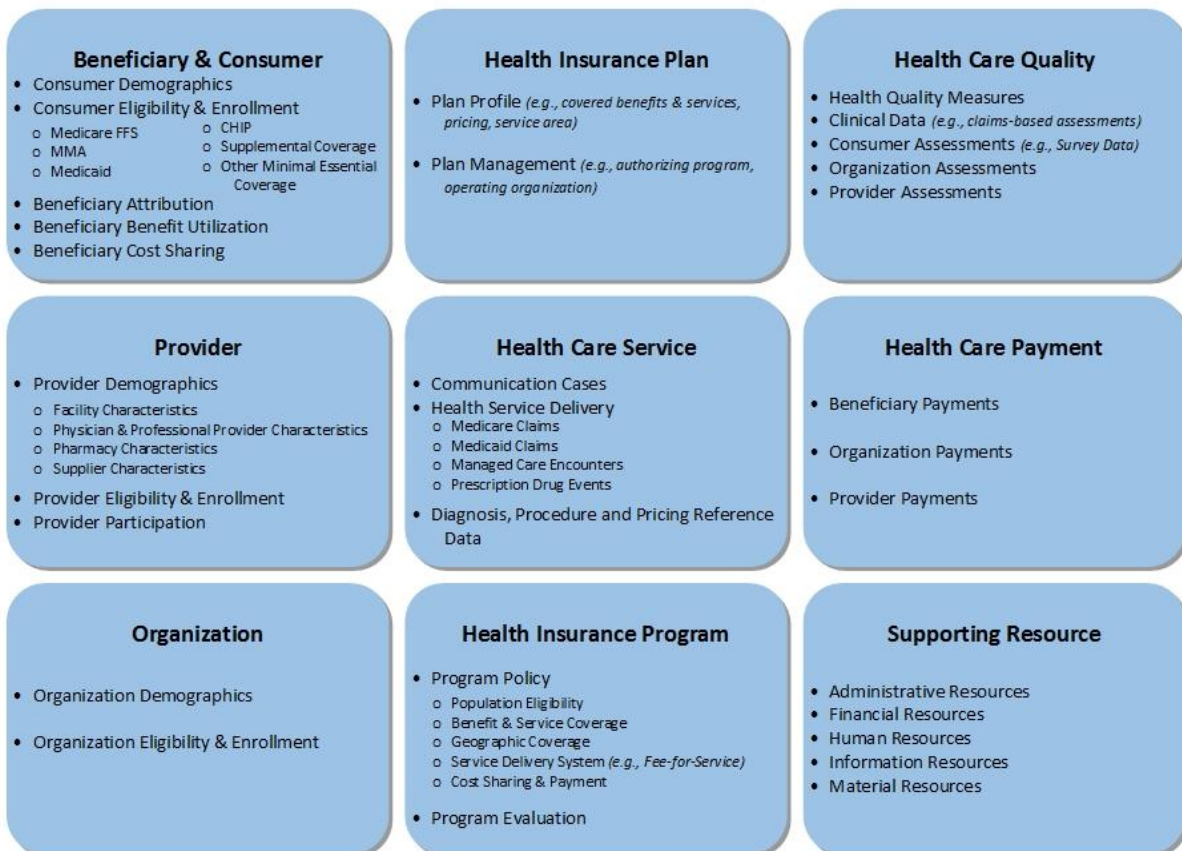
Figure 3 - Data Categories and Category Subtypes