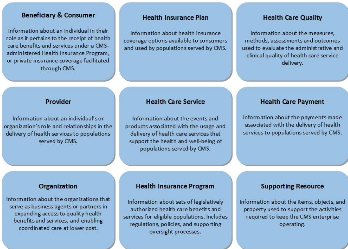
Figure 2 - Subject Areas