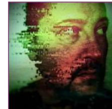
Kyle Bellamy Design EQRS