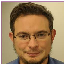
Andrew Johnson Development iQIES