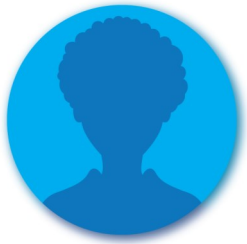
HCQIS (HealthCare Quality Information Systems) Information and Data Center