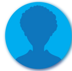
HCQIS (HealthCare Quality Information Systems) Information and Data Center Support (HIDS) Onboarding Lead