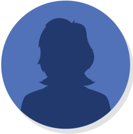
Transition Team Member