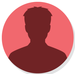
Center for Medicaid and Medicare Services (CMS) Contract Office Representative (COR)