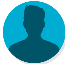
Division of Services and Infrastructure Fulfillment (DSIF) Onboarding Lead