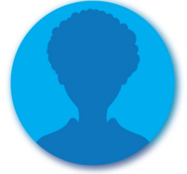
HCQIS (HealthCare Quality Information Systems) Information and Data Center Support (HIDS) Onboarding Lead