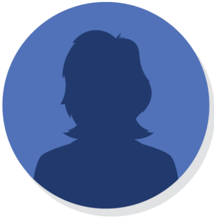
Transition Team Member