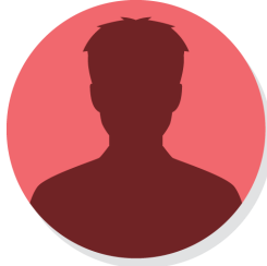
Center for Medicaid and Medicare Services (CMS) Contract Office Representative (COR)