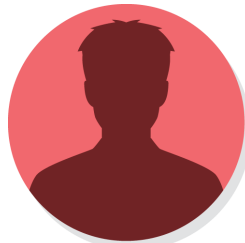
Center for Medicaid and Medicare Services (CMS) Contract Office Representative (COR)