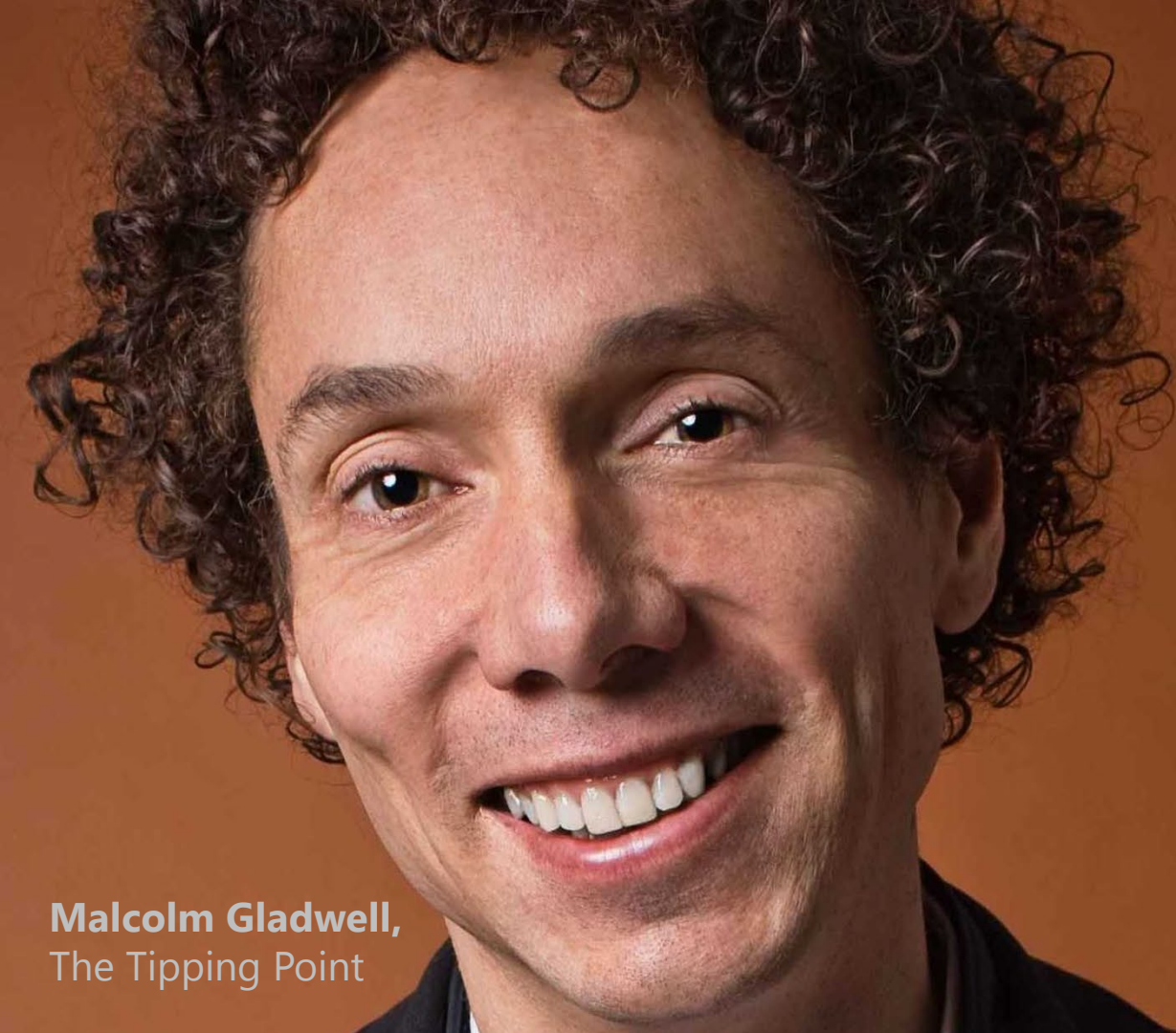
Malcolm Gladwell, The Tipping Point

Mavens make change happen through information and ideas.